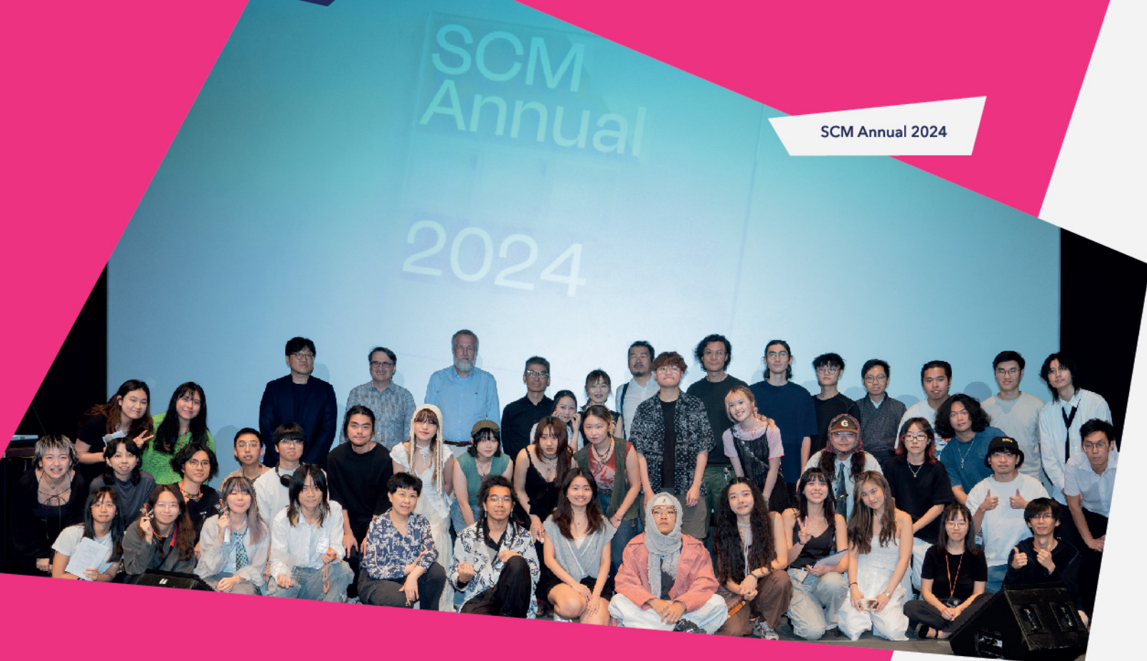
SCM Annual 2024

For details, please refer to https://www.cityu.edu.hk/admo/