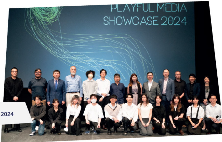
SIG Playful Media Showcase 2024